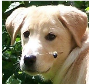
Gracie and bumblebee