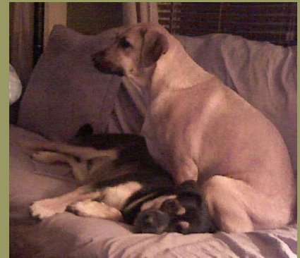
Tessa and Darby today, enjoying a lazy day on the couch.