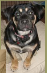
A young Tessa

This is Tessa and Darby. They were Nala's puppies. Nala was VERY pregnant when we rescued her from the shelter she was in. Not long after her rescue, she gave birth to these two bundles of joy, among others! Thankfully, these two littermates were able to stick together, and now they enjoy the good life like only labs can do!