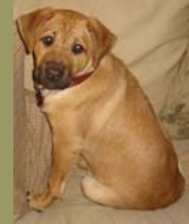
A young Darby